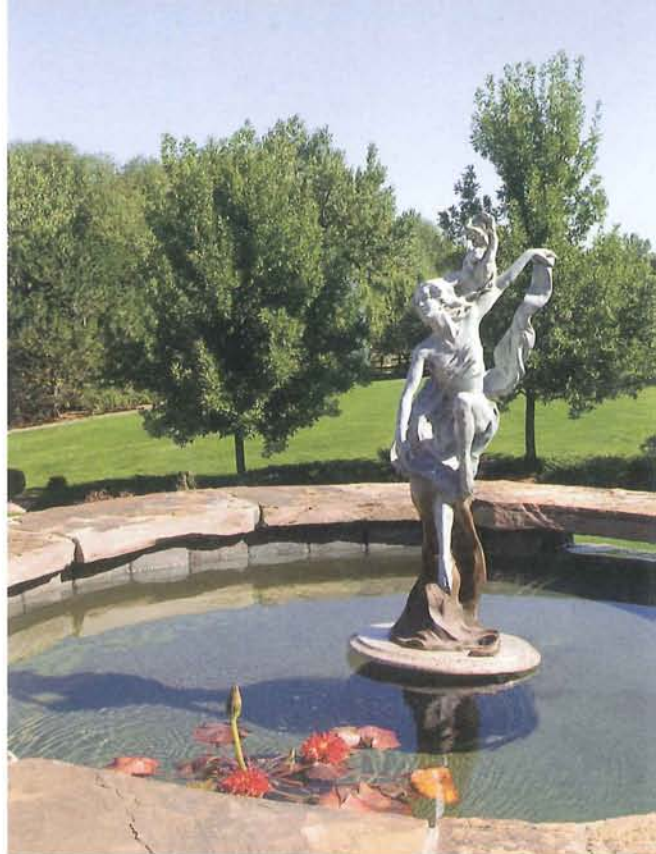
ABOVE: This pond and elaborate statue on the upper patio contains a waterfall that tumbles to the patio below.