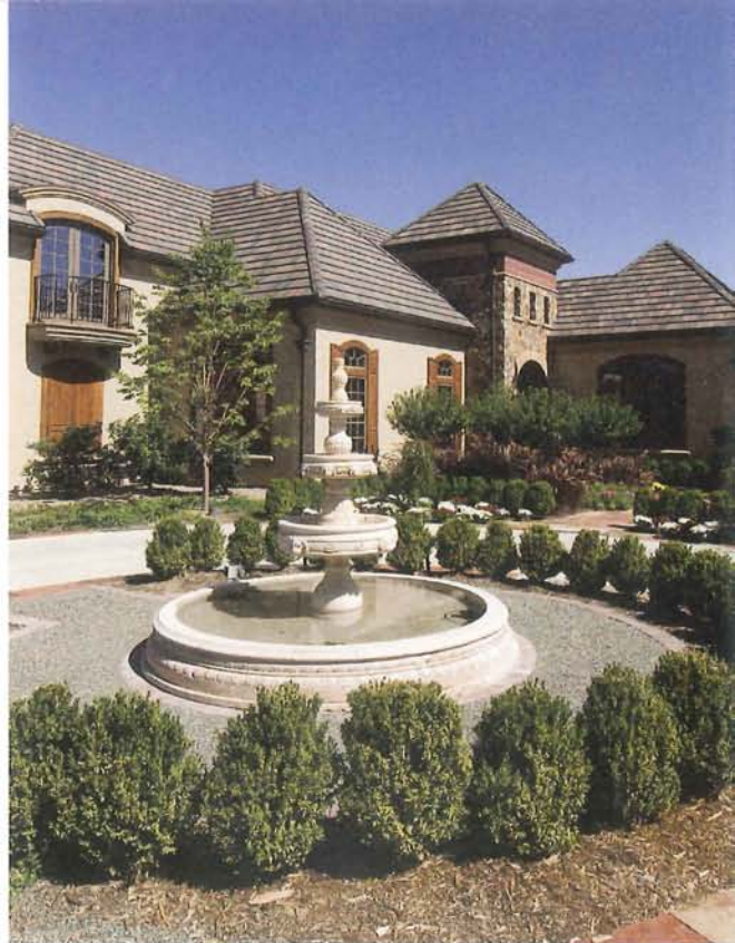
ABOVE: A large fountain surrounded by boxwoods greets guests as they arrive at the home.

RESOURCES Landscape architect, plant installation and hardscapes: Scott Deemer, Outdoor Craftsmen, Ltd.; Plant suppliers: The Tree Farm; Kiyota Greenhouse; Hot tub area: Aquality Construction; Fireplace: The Gas Connection; Furnishings: Thornton Design; Fish and pond supplies: Koi Lagoon; Sculptures: Bobbie Carlyle (rear yard); Monty Dufelt (front yard); Audio: EHT