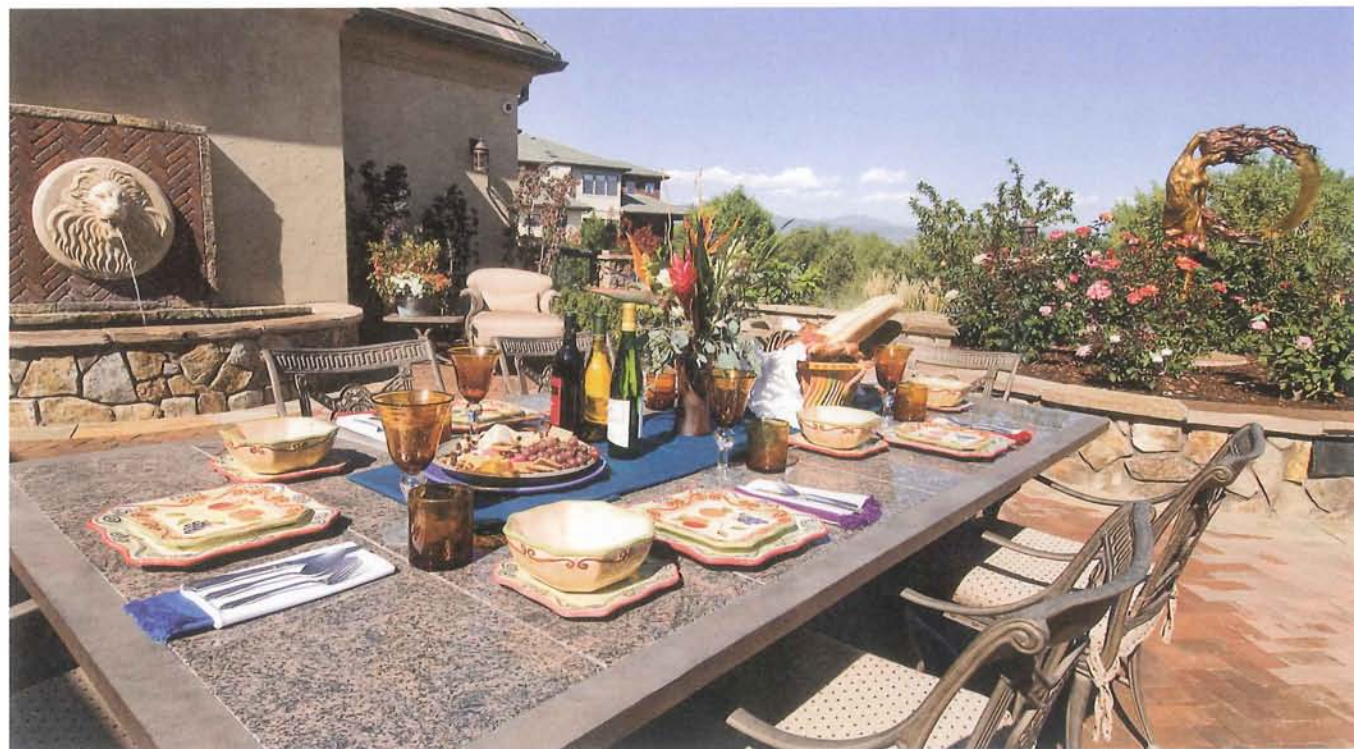
BELOW: The outdoor dining table overlooks a massive bronze statue residing in the center of a rose garden.